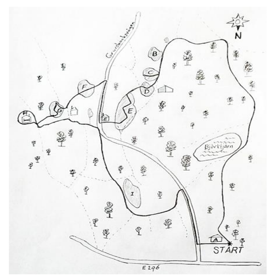
The footpath is 4 km long and marked with white bars and 17 yellow arrows.